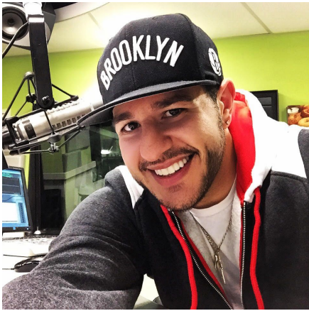
Mo'Bounce Afternoons 2-6pm