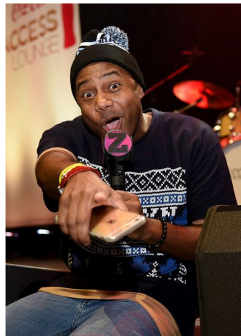
Maxwell Evenings 6-10pm